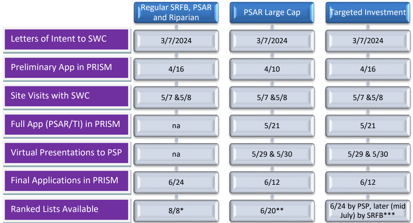
Figure 1. Comparing deadlines by grant program.

* Ranked by Skagit Watershed Council, funded by SRFB and Puget Sound Partnership’s PSAR Program